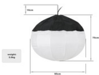
CineBall T2000 Lantern Light